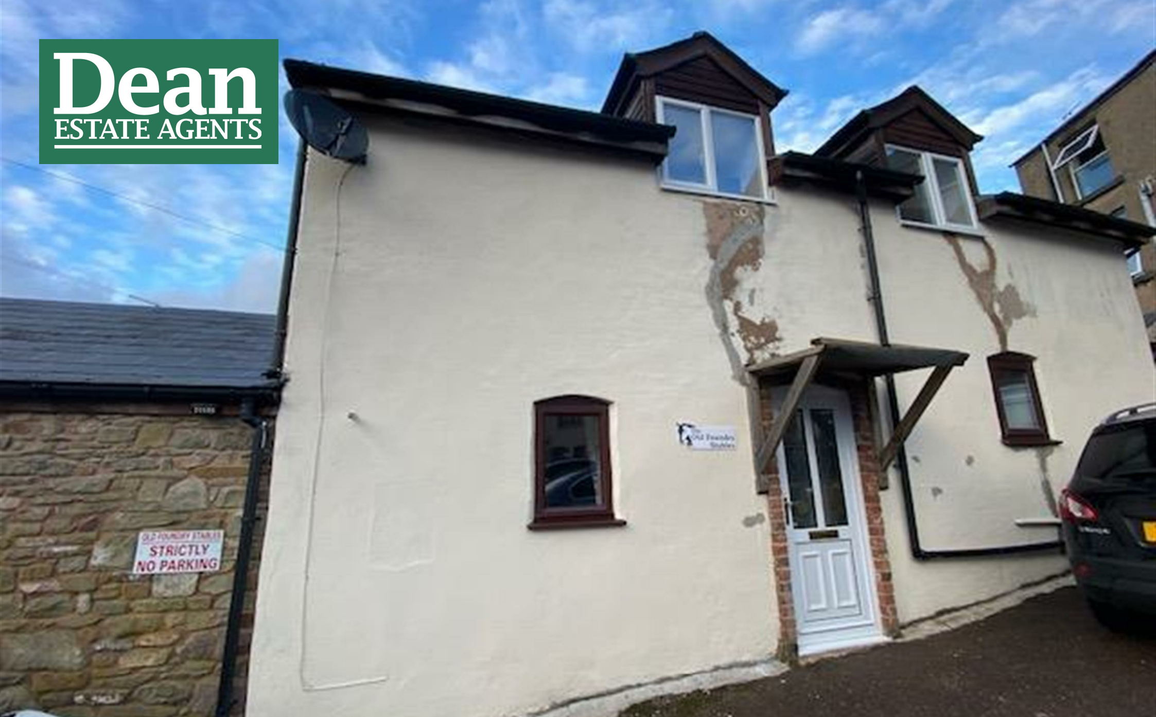
Foundry Road, Cinderford, GL14 2JP £850 PCM